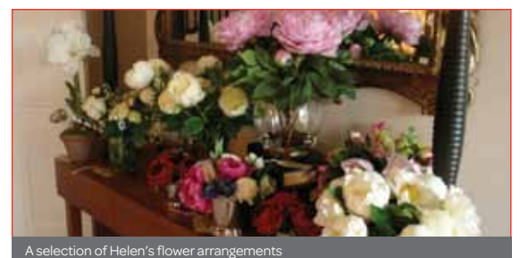
A selection of Helen's flower arrangements

For more information and details on the Potting Shed, check out www.thepottingshed.org